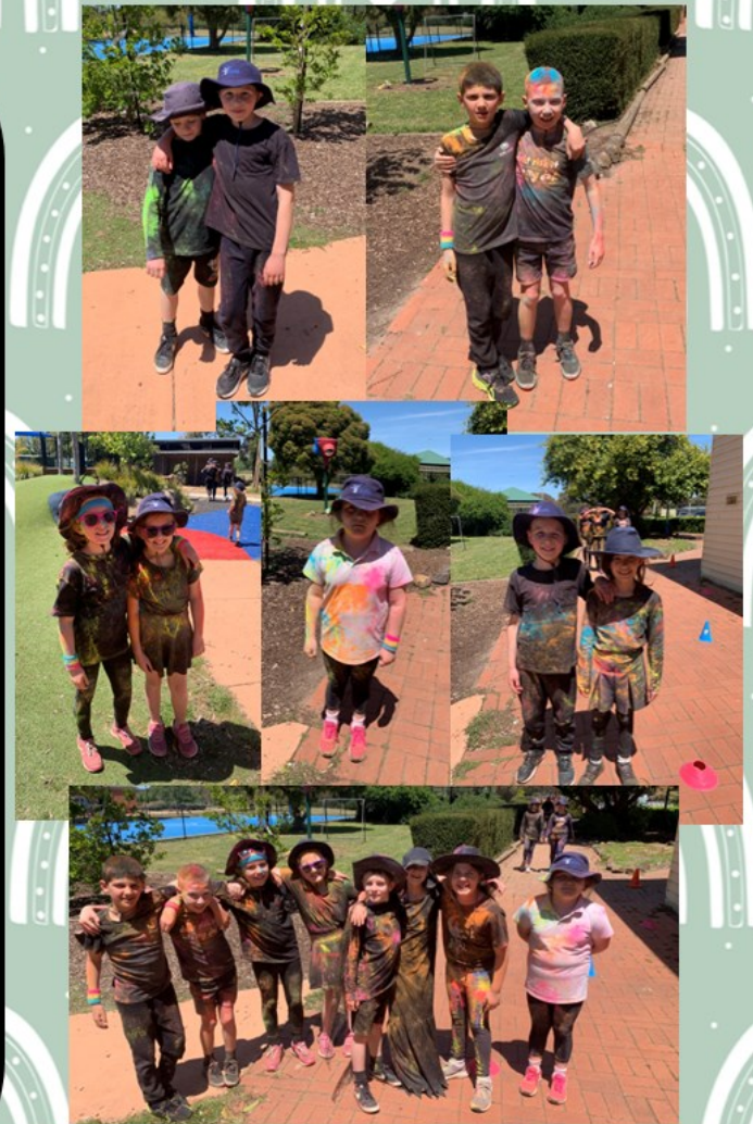
Colour Run Fun!

In Measurement, we have started to work on mass, which is all about how heavy and light things are!