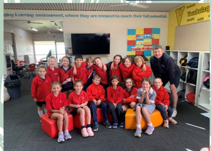
Our Grade 3 students completing NAPLAN! Also we finally had a full class!