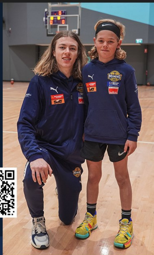
Basketball Ballarat Term 2 Community Programs

Basketball Ballarat provide children with a fun and safe basketball experience that will serve as an introduction to a lifetime involvement in the game. A wide variety of introduction to basketball programs are ran by Basketball Ballarat, allowing children to start learning basketball as young as 4 years old.